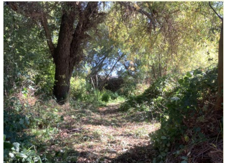
Blockage 7, after, 10/10/23.