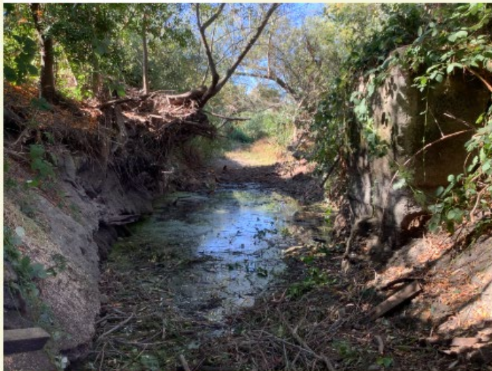
Blockage 1, after, 10/3/23.