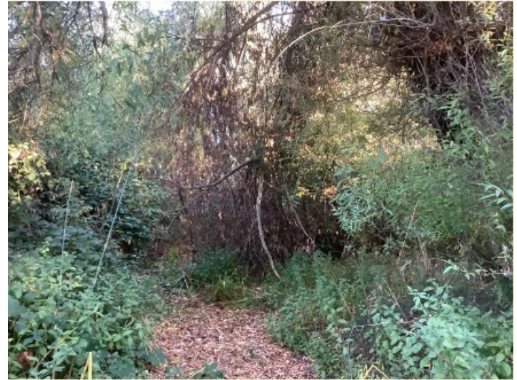
Blockage 7, before, 10/4/23.