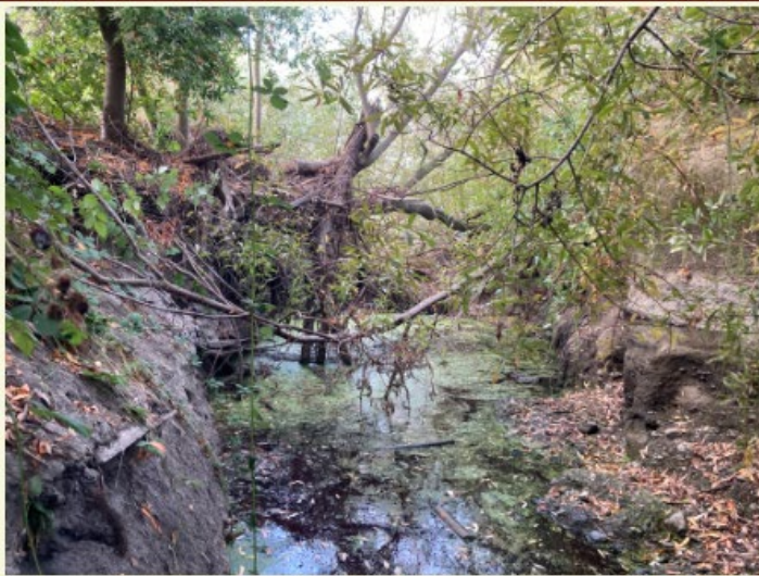
Blockage 1, before, 10/2/23.